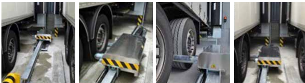
Waiting for truck

Compliance with ED 6059 recommendation and with machinery regulations